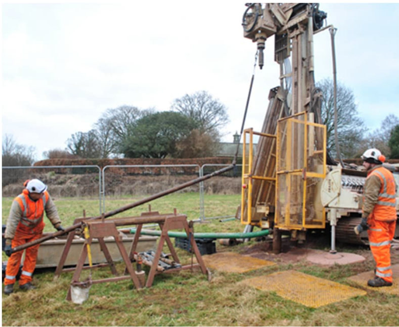
Wireline coring the bedrock formations