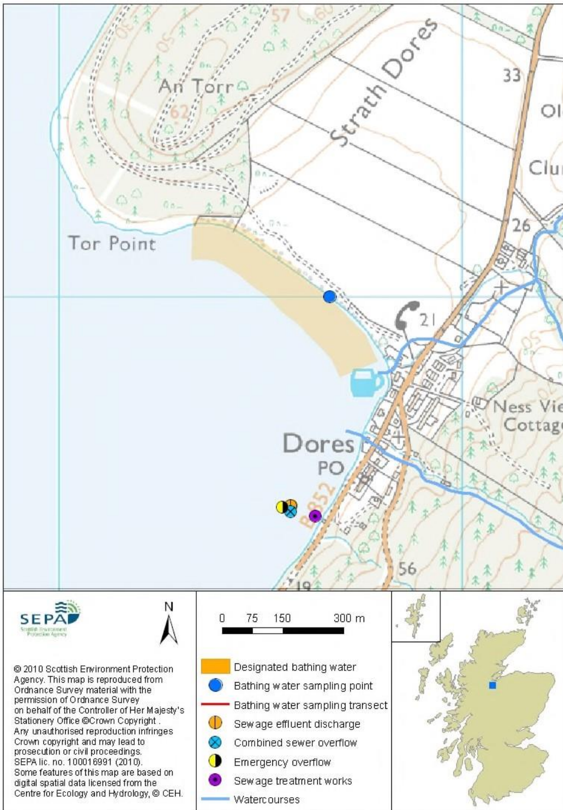
Map 1: Dores bathing water