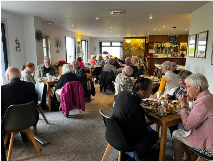
Get-Together in Gairloch Golf Club – 18 th May

Highland Senior Citizens Network is joining Alzheimer Scotland, NHS Highland Community Mental Health Team, Badenoch Shinty Memories and Caberfeidh Horizons in holding a special Café to Connect in Talla Nan Ros, Kingussie, on Sunday 4th June from 2 to 3.30 p.m. celebrating Dementia Awareness Week, Carers' Week and Volunteers' Week. Please feel free to join us!